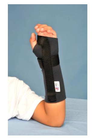
Figure 2: Splint