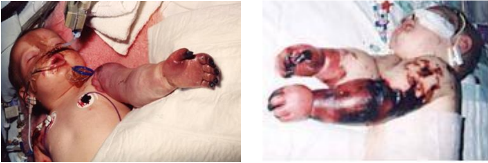
Fig 2: Infant with sepsis and DIC