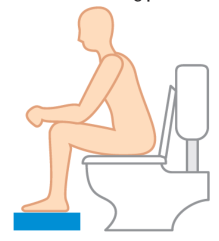
Knees higher than hips, Lean forward and put elbows on your knees, Bulge out your abdomen. Straighten your spine,

© Continence Foundation of Australia 2007